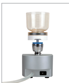
Improve operation time