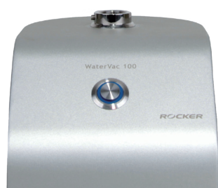
WaterVac 100 Vacuum Filtration System (190100-01/02) (US plug / EU plug)