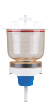
Rocker, 300 ml MF 3, Magnetic Filter Holder (200300-01)