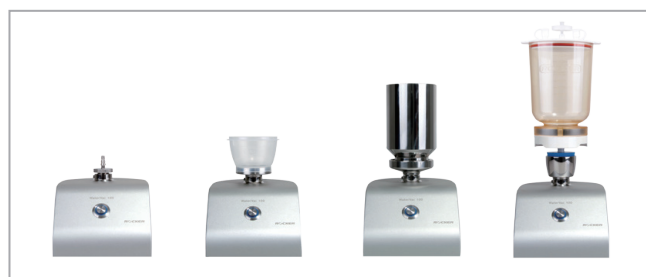
Compatible with various kinds of adaptor and filter holder