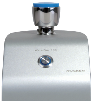
WaterVac 100 - MS Vacuum Filtration System (190110-01/02) (US plug / EU plug)