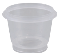
Millipore, 100 ml / 250 ml disposable plastic funnel (MIACFD101 / MIACFD201)