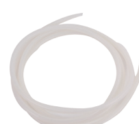
Silicone Tube Ø 4.2 - 8 mm, 200 cm (199100-68)