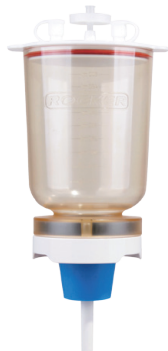
Rocker, 500 ml MF 5, Magnetic Filter Holder (200500-01)