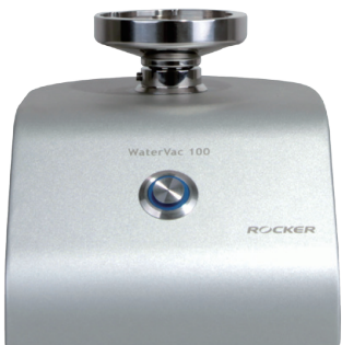
WaterVac 100 - MB Vacuum Filtration System (190120-01/02) (US plug / EU plug)