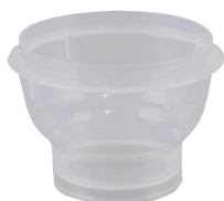
Sartorius, 100 ml disposable plastic funnel (16A07)